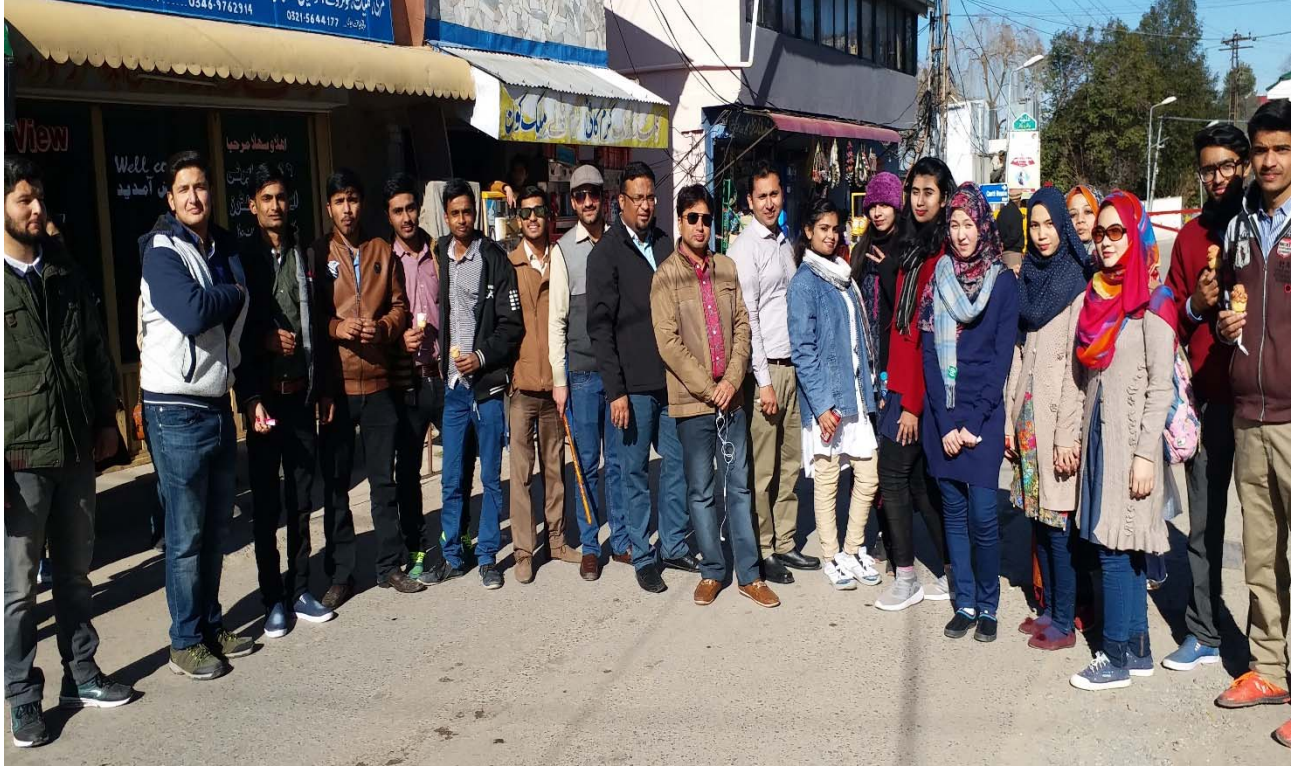
Visit to Kashmir Point, Murree