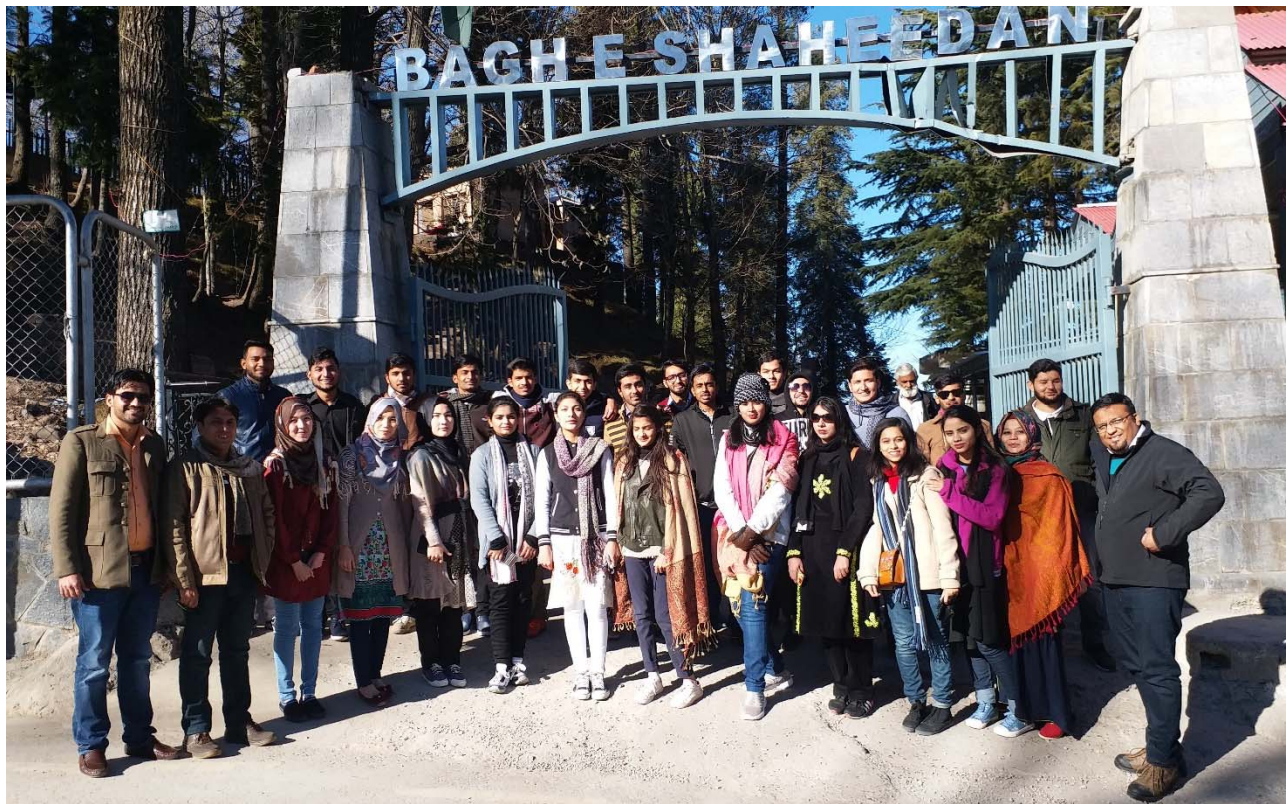
Visit to Bagh-e-Shaheedan Park, Murree