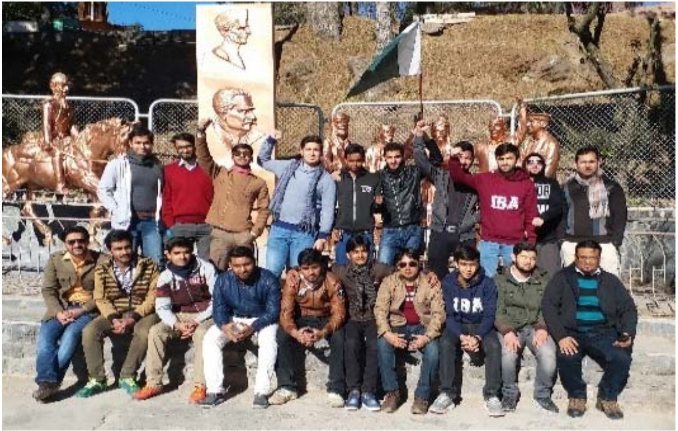
Visit to Bagh-e-Shaheedan, Murree