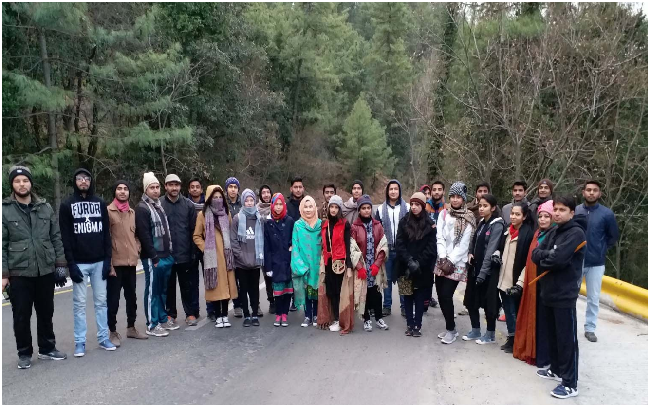
Morning Walk on the Murree Street