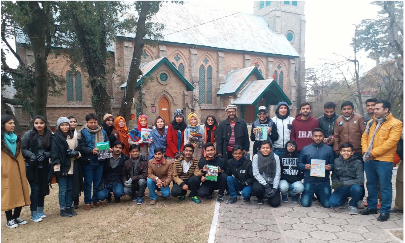
Visit to Holy Trinity Church, Murree