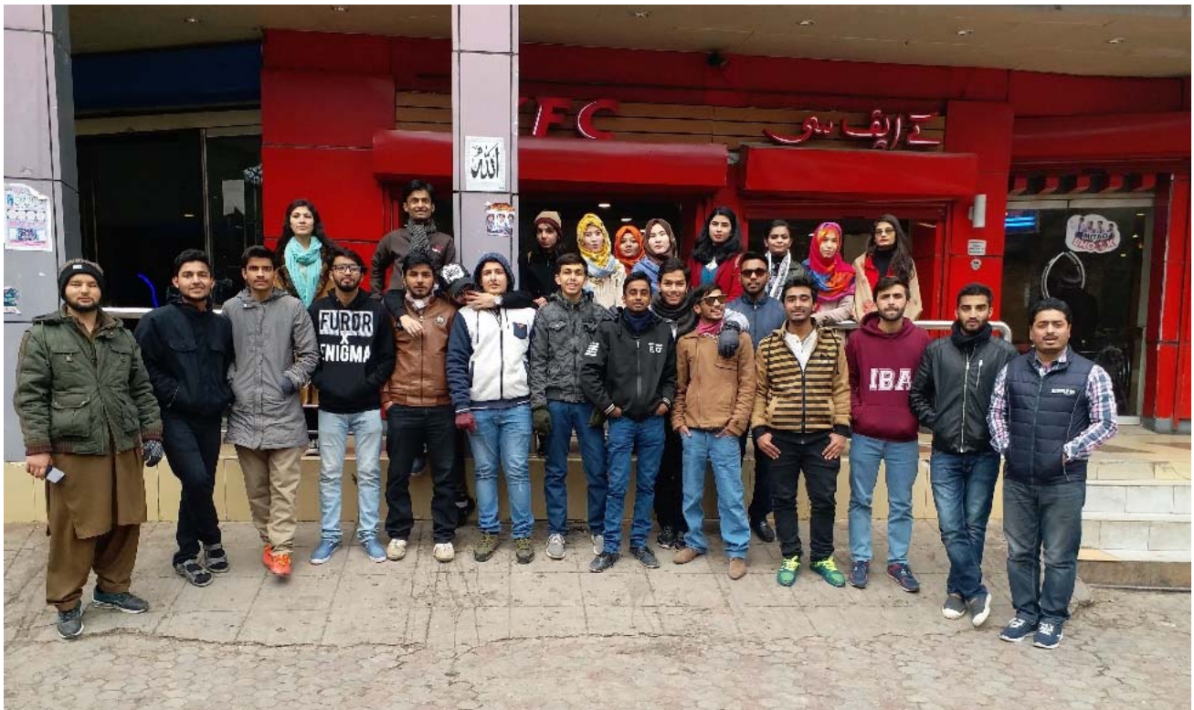
Visit to Mall Road, Murree